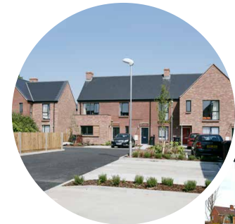
Semi Detached Form