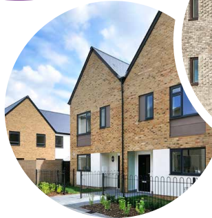
Brickwork detailing & contrasting materials