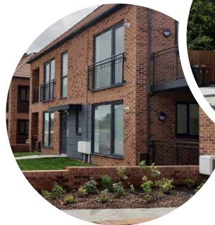
Good sized windows