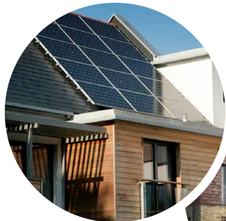
Solar Panels & Slate Roof